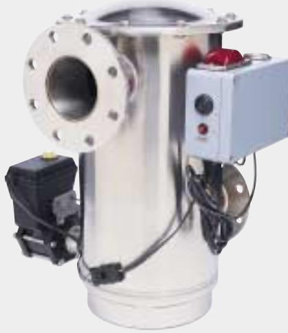
SF Series filter shown with optional pressure differential alarm and automatic flush timer.

Optional package electronically monitors pressure and purges reservoir.