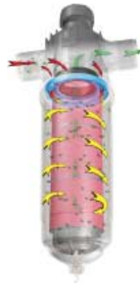
Reliable TD Series filters provide 150 mesh full flow filtration. Flow rates up to 200 gpm.